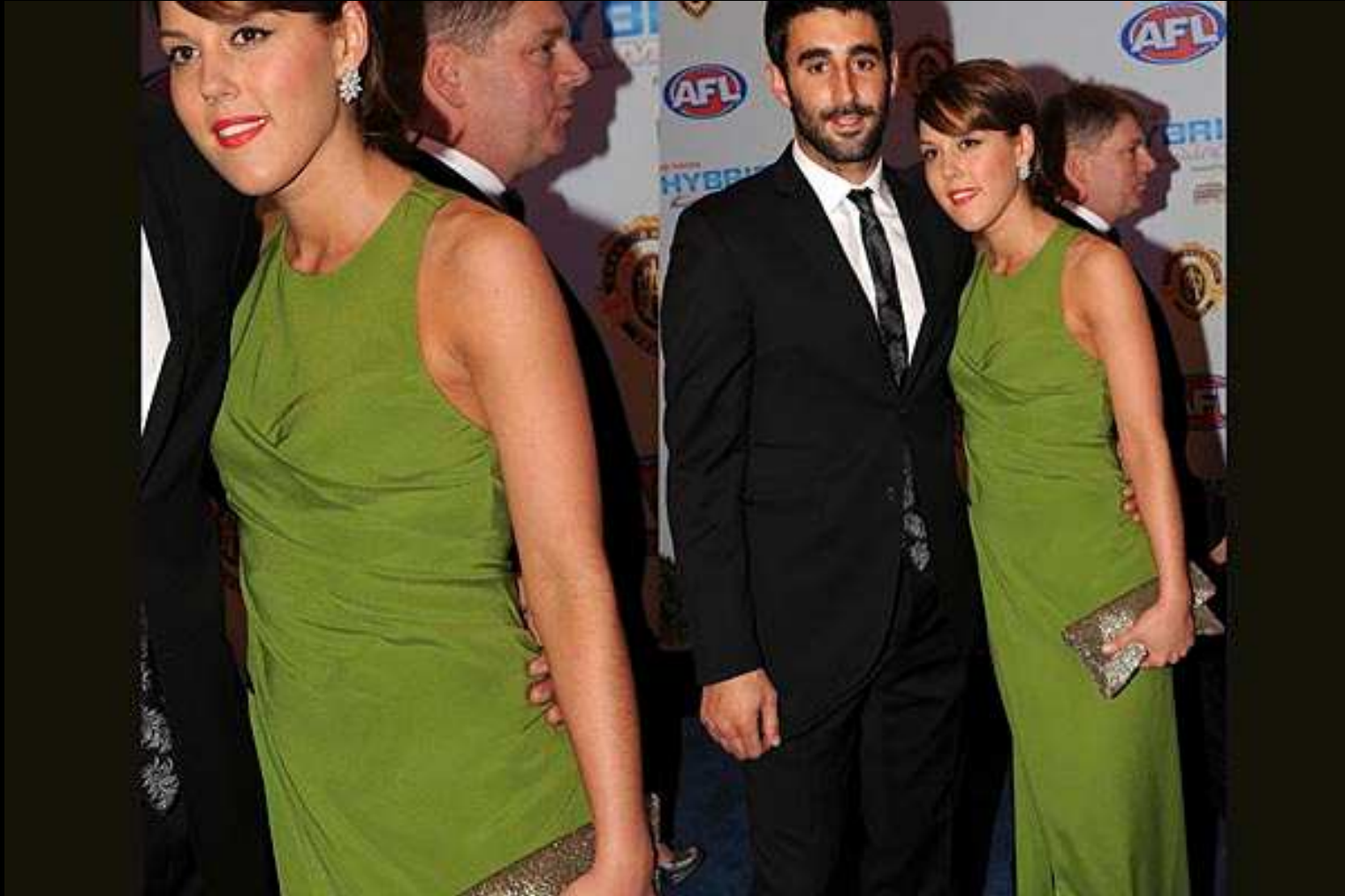
Adelaide, the fashion capital.