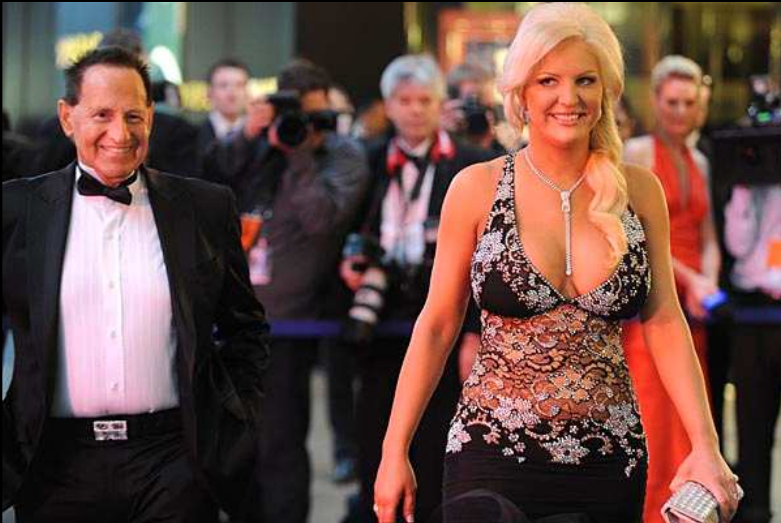
Freakshow Part II.