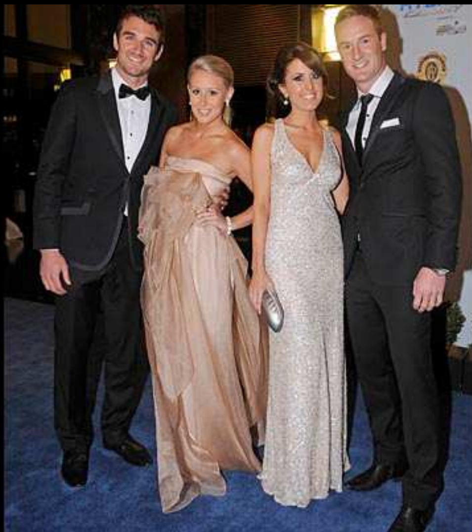
Yr 12 formal photos